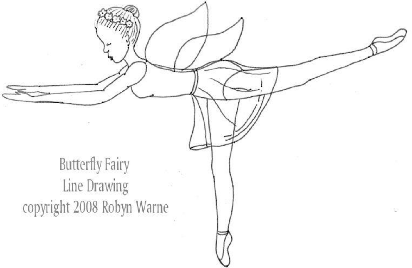
Butterfly Fairy Line Drawing copyright 2008 Robyn Warne